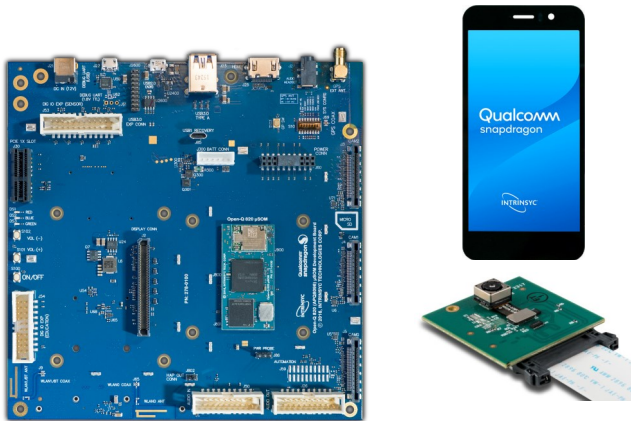
Optional Display & Camera

Development Kit includes: Carrier board, SOM, 12V power supply, HDMI cable, Quick Start Guide, access to full documentation, SW updates, and basic development kit support.